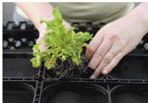
4. Turn module on side, cut diagonal slices in geotextile fabric, forming an "X" opening, and plant green life of your choice.