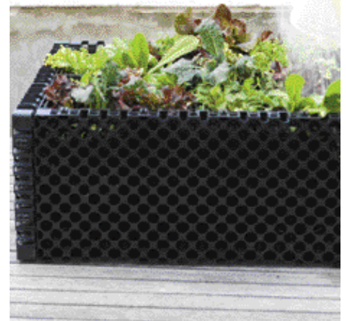
5. Water modules well and let sit on side for two weeks to allow new plants to root. Once rooted, fix to the vertical structure of your choice.