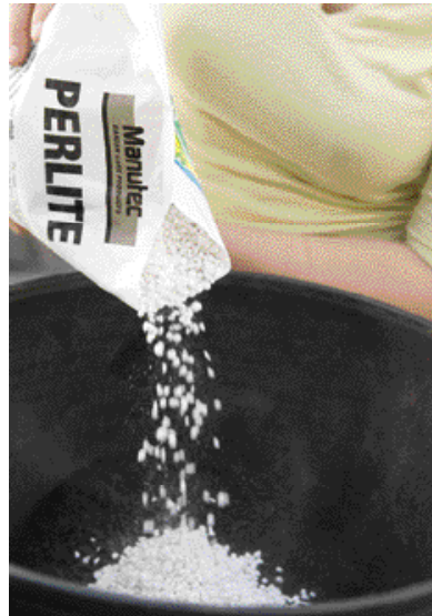
1. Pour potting mix, crushed Perlite (a man-made growing medium often used for hydroponics) and polystyrene beads into a tub and mix.

Create a vertical garden of your own with these simple instructions from Nursery & Garden Industry Australia