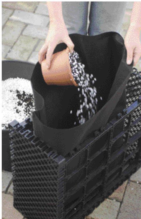
3. Add Perlite, polystyrene beads and potting mix into the geotextile bag, fill to top and cover with a piece of geotextile and then close module by adding the end piece.