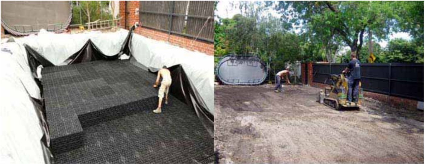
A 50,000 litre Cellutank® underground water storage system (above) being installed at a private residence in Hawthorn Melbourne. Run-off stormwater from roof areas is stored within the modules and is used to irrigate surrounding landscaped areas.

CelluTank® stormwater tanks are available in several load-bearing capacities and cater for the requirement of individual houses up to the largest commercial and industrial developments. The load-bearing capacity is increased with the use of additional proprietary 'stabilisers'.