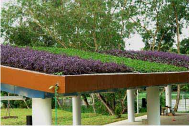
Pasir Ris Park Singapore