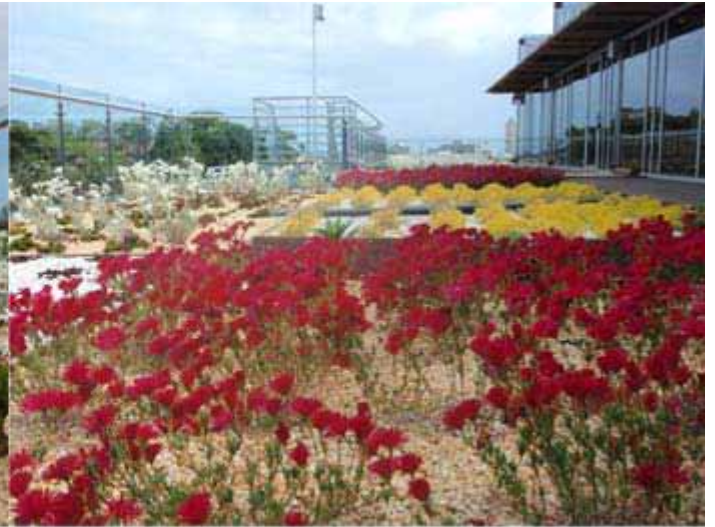
Holt & Hart Building Sydney