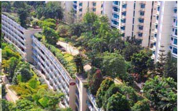
HDB Car Park Edgefield Plains Singapore