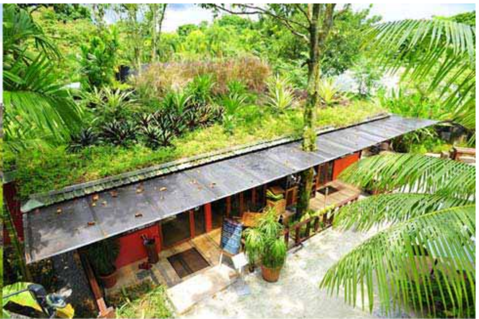
Arams Spa Singapore