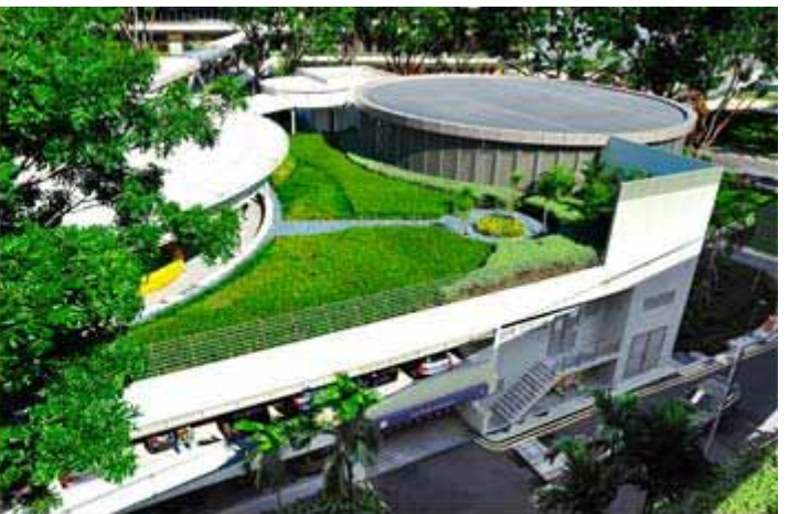
Singapore Flyer Adjacent Car Park Singapore