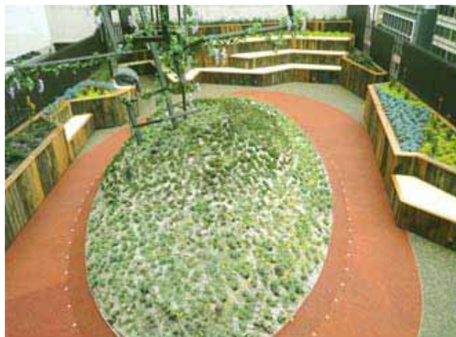
131 Queen Street Melbourne