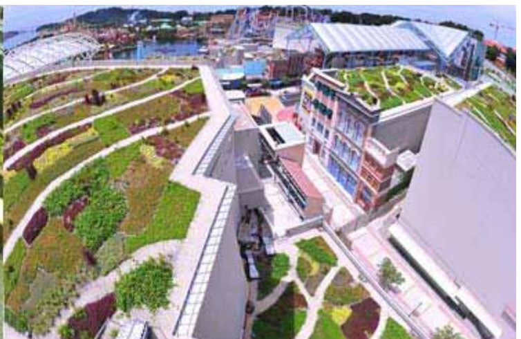
Universal Studios Singapore