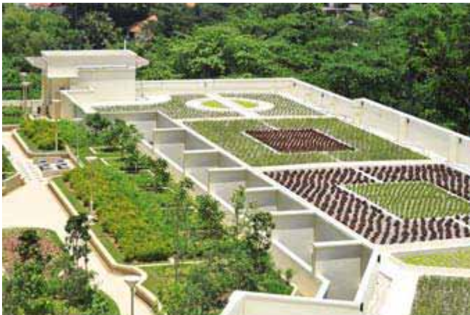
HDB Car Park Holland Drive Singapore

Elmich Green Roof System offers an important option to address climate change issues created by larger and taller buildings and increased city densities. Elmich has supplied landscape products world-wide to more than one million square metres of residential, commercial and industrial projects resulting in environmentally sustainable structures.