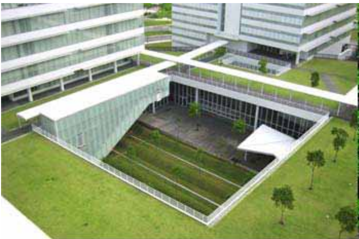
Republic Polytechnic Singapore