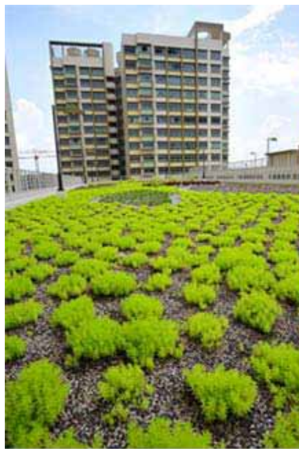
HDB Punggol West Singapore