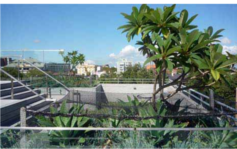
The Westbury Apartments Sydney