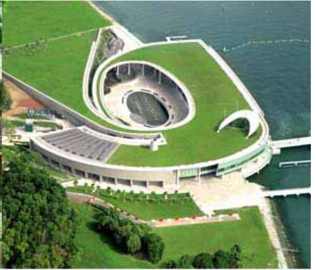
Marina Barrage Singapore