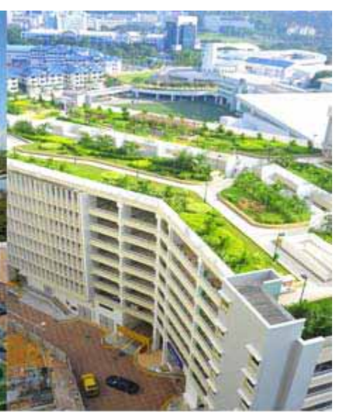
HDB Car Park Dover Crescent Singapore