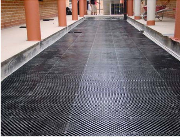
VersiCell drainage cells were interlocked, positioned on the waterproof membrane (left) and geotextile installed (below)