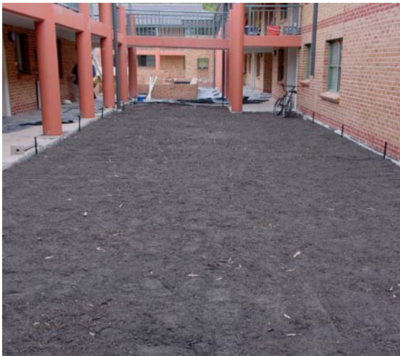
Soil mix was positioned on the geotextile (above) and landscape plants installed (right)