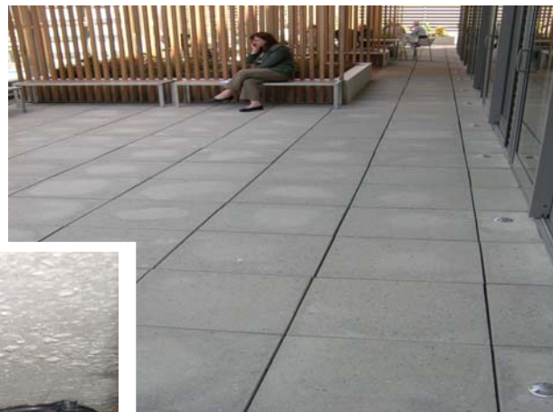
VersiJack supporting pavers at the Department of Conservation Building Wellington New Zealand (right and below)