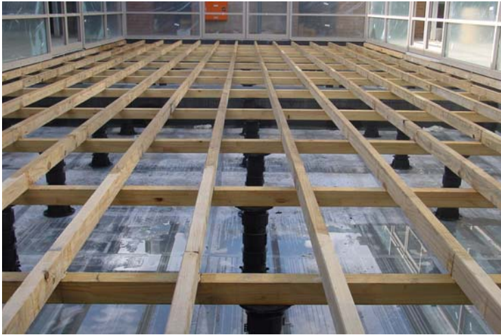
VersiJack supporting beams on a commercial development at Balmain NSW (left)