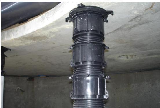
VersiJack supporting large pre-cast concrete slabs at Waterplay in Brisbane (left and below)