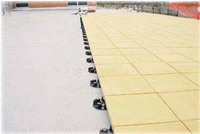
VersiPave®GP creates a level, free draining paved surface at Greenslopes Hospital in Queensland

VersiPave®GP offers many advantages for commercial and domestic installations. By eliminating the weight of heavy sand and cement screeds, allowing superior drainage and ease of access to underlying service cables and waterproofing membranes, VersiPave®GP is a highly effective choice in both the short and long term for many applications.