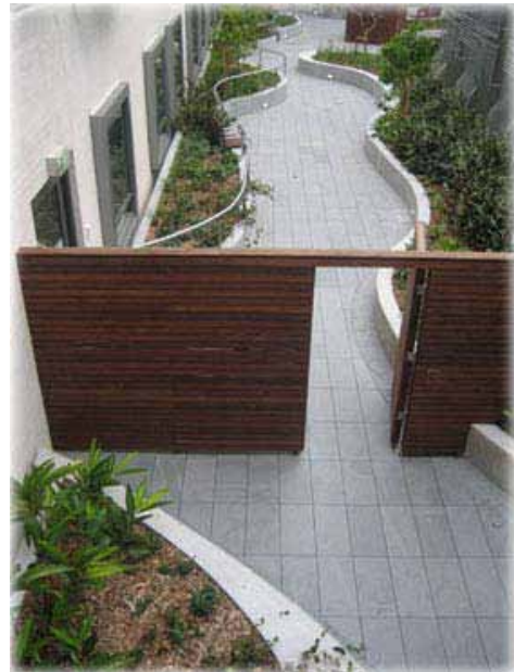
VersiPave®GP allows easy access to waterproofing membranes and services at the Burger Retirement Centre at Randwick in Sydney