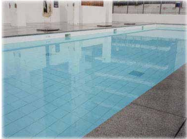
At the Mirvac Apartment Complex at Burswood in Perth, VersiPave®GP enables wet surfaces to drain freely, promoting safety.

VersiPave®GP is suitable for rooftops, decks, balconies, swimming pool surrounds, water features, courtyards, patios and more. Each VersiPave®GP unit can be sectioned into halves or quarters to fit along edges and corners.