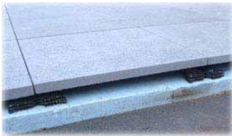
The 1,200m 2 free draining rooftop of Transport House in Sydney (above), with pavers supported on VersiPave®GP positioned on insulation board (below).

Made from 100% recycled plastics, VersiPave®GP is lightweight but strong enough to support a 2,400 kg load.