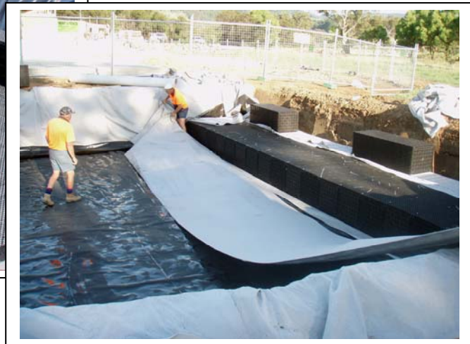
A number of VersiTank re-use systems were installed at a residential estate at Berry NSW to enable captured and stored water to be used to irrigate landscaped areas.