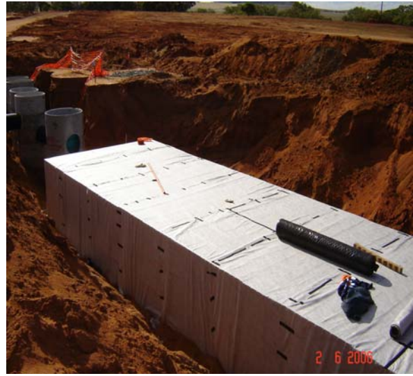
A large VersiTank installation in Geraldton Western Australia, supplied by Geofabrics Australasia Pty Ltd., acts as an underground infiltration system for storm water run-off from an industrial estate.