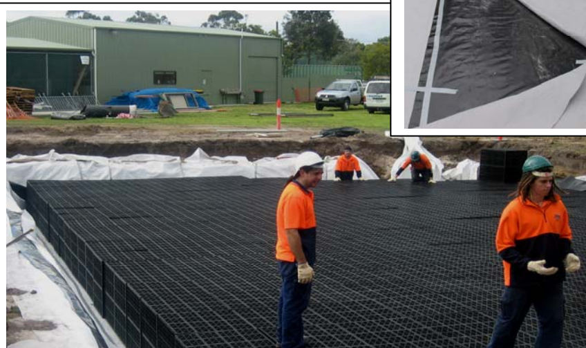
VersiTank system enveloped with Bidim A34 geotextile and an impermeable membrane stores storm water at Kilbreda College

A 180,000 litre VersiTank storm water re-use system at Kilbreda College at Mentone, Victoria, enables stored water to be used to irrigate sports fields. The collaborative project, that actively involved college students, resulted in Chadoak Plumbing and Drainage, winning the Green Plumbers Commercial Plumbers Project of the Year Award